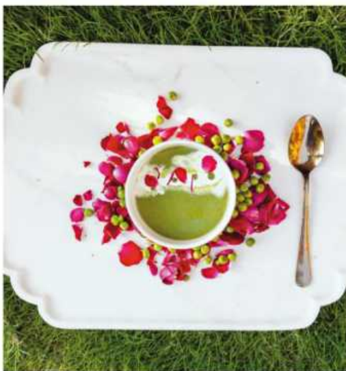
From top: The living room-like lobby of 28 Kothi; the hotel's farm-fresh pea soup served gardenside.